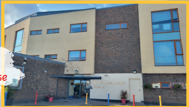
Current Ronald McDonald House